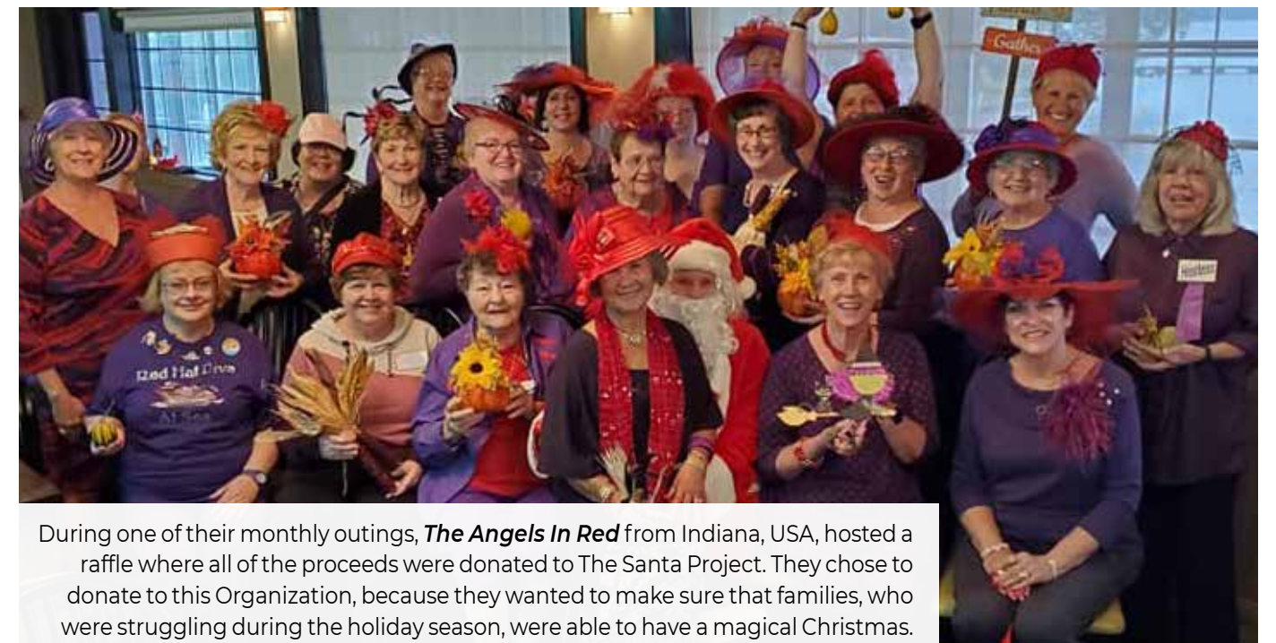
During one of their monthly outings, The Angels In Red from Indiana, USA, hosted a raffle where all of the proceeds were donated to The Santa Project. They chose to donate to this Organization, because they wanted to make sure that families, who were struggling during the holiday season, were able to have a magical Christmas.