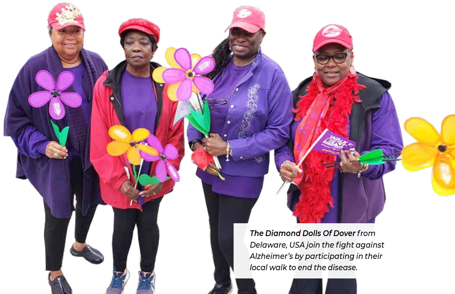
The Diamond Dolls Of Dover from Delaware, USA join the fight against Alzheimer's by participating in their local walk to end the disease.

Let's give a round of applause to these members who have been able to make an impact in their local communities while continuing to have a fun Hattitude!