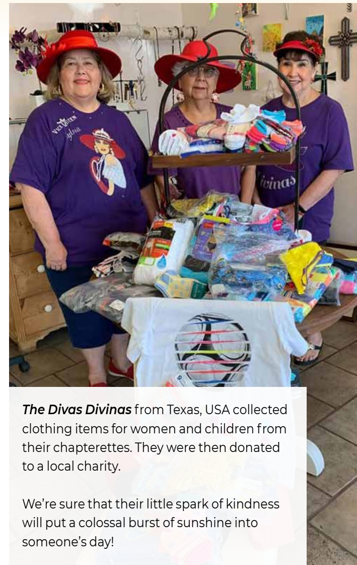
The Divas Divinas from Texas, USA collected clothing items for women and children from their chapterettes. They were then donated to a local charity.

We're sure that their little spark of kindness will put a colossal burst of sunshine into someone's day!